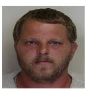
Charge/Offense Contact sheriffs office.