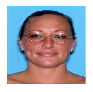
er, 40 Location Details Last Reported Address -Out Of State, Ashtabula, OH 44004