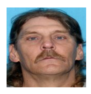
, 60 Location Details Last Reported Address -Out Of State, Ashtabula, OH 44004