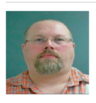
nen, 59 Location Details Last Reported Address -Out Of State, Ashtabula, OH 44004