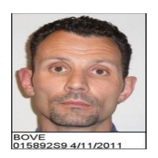
, 52 Location Details Reported Address -Out-Of-State, Ashtabula, OH 44004